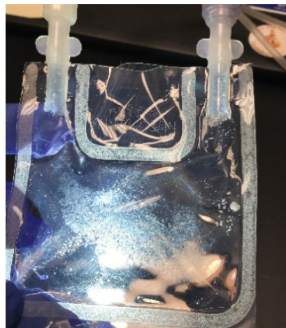
Figure 1. MSC culture in VueLife® 32-C bag using dissolvable microcarriers.

VueLife® bags are made of FEP film, which is transparent, remains flexible between -200°C and +200°C, and provides high permeability to oxygen and carbon dioxide, allowing for efficient gas exchange during culture. In addition, the FEP films provide a non-adhesive surface, which in turn supports efficient use of microcarriers by minimizing adhesion of cells to the bag material.