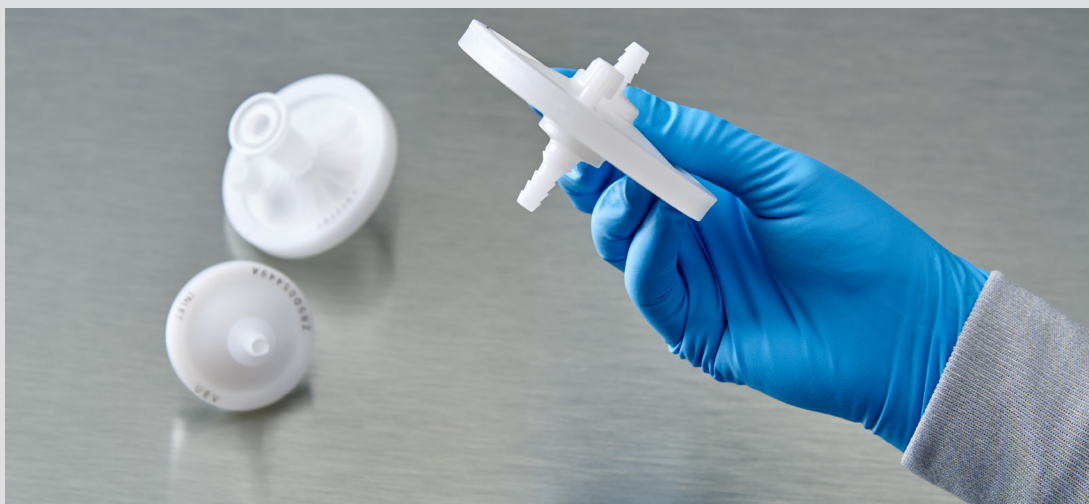
PureFlo® is a registered trademarks of Saint-Gobain Life Sciences

^ = fitting is available (if it is a hose barb, it is stepped or tapered)