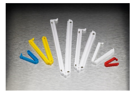
Fig. 3 Various sized clamps for use with VueLife "C" Series Bags