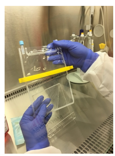
Fig. 4a Clamp applied for use with VueLife "C" Series Bags