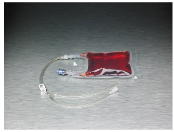
Fig. 2 FEP bag featuring a "Y" connector with 7" PVC tubing containing a female luer end and a heat sealed sterile docking tube

This swabable needleless injection site allows for multiple use. The valve stem and body will mate securely with all standard luer syringes, luer connectors, and needle adapters. This port is made to be used multiple times (be sure to disinfect the port before and after use).