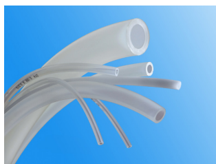
C-Flex® comes in a wide variety of sizes and formulations.

The performance of tubing in peristaltic pumping applications is affected by the conditions of use and equipment utilized, along with size and all thickness of the tubing tested. The data above is presented for information only and should not be utilized for specification purposes.