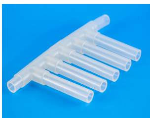
One-piece overmolded C-Flex® manifold maintains inner bore diameters with superior reliability and product integrity.