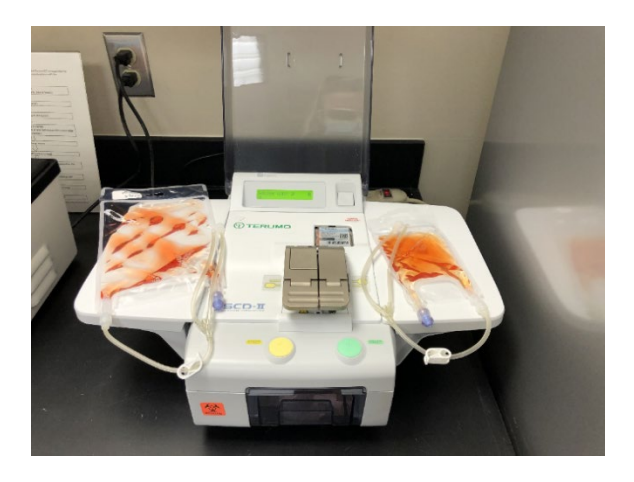
Figure 3. VueLife® bags can be connected using a sterile connection device and welding the ends of the Y-tubing.

Cell cultures can be transferred from one bag to another via two methods: a) manual transfer via syringe and b) transfer via a sterile connection device.