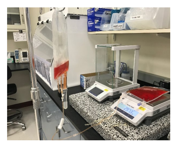
Figure 2. Addition of culture media from media bag to VueLife® culture bag. Bag contents can be transferred via gravity and volume can be tracked by using a lab scale.